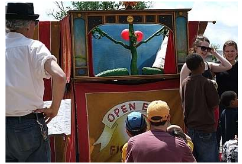
Open Eye at Lake Street Sidewalks Day

And what's her message to other local business owners? "Come on down and see a show!" Their next is the annual Holiday Pageant which they hold at the Pantages Theater downtown. It's happening December 15th starting at 7:00 PM. Come and bid on the tickets to it that they donated to our silent auction! Or call them at 612-874-6338 or visit their website at www.openeyetheatre.org to book some for yourself.