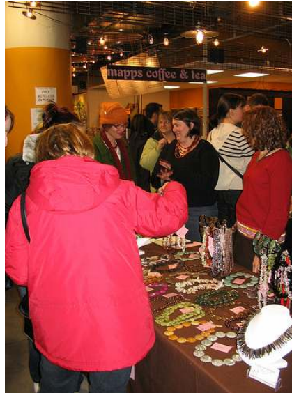
No Coast Craft-o-Rama at the Global Market

Also in the Global Market, Andy's Garage is back open for business, serving up classic American food like burgers, fries, melts, and shakes.