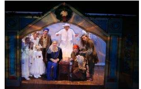
A scene from 2007's Holiday Pageant