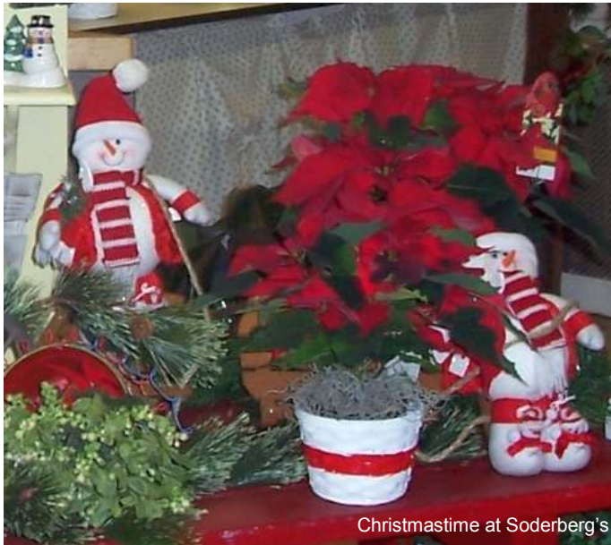
Christmastime at Soderberg's