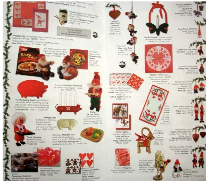
A sampling of Ingebretsen's Christmas treats from their catalog

And of course there is their website, at www.ingebretsens.com . These days, it's a big part of Ingebretsen's success. Mail order business, which includes orders through both the catalog and the website, has risen from 20% of their total business a few years ago to 30% today. Every few years, they overhaul the site, making new improvements and updates. Soon, Ingebretsen's will be tracking its entire inventory by computer,