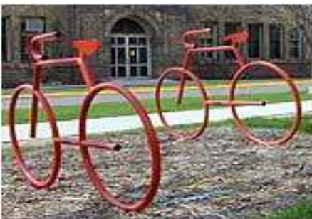
Look for these in silver up and down Lake